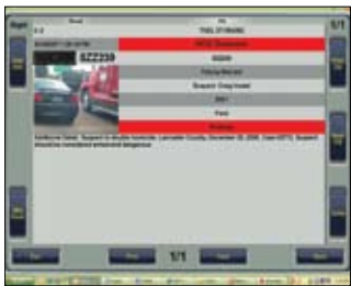
PIPS PAGIS In-Vehicle Software