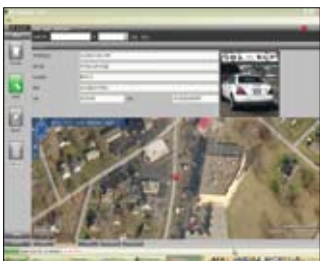
PIPS Back Office System Server (BOSS®) Software